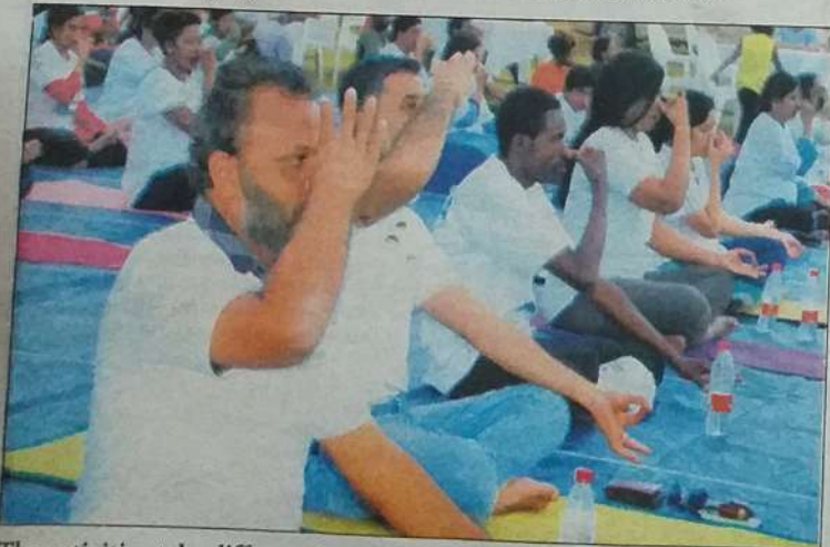
The activities take different forms