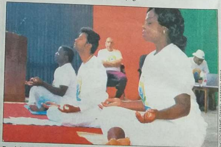
Participants deep in meditation