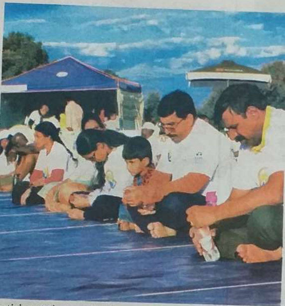
Participants in a meditation exercise