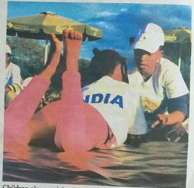
Children also participate in yoga