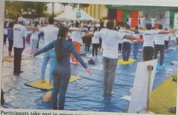
Participants take part in group exercises