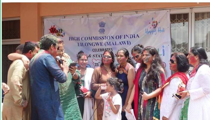
Singing of patriotic songs by the Indian Community