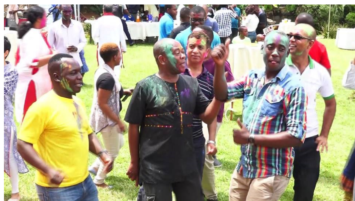
Recently Returned ICCR and ITEC alumni